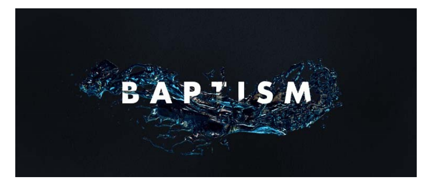
A Christmas Baptism December 4-5, 2021