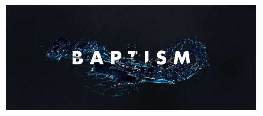
A Christmas Baptism December 4-5, 2021